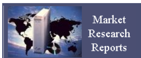
TABLE SALT - PEPPER + SPICES REPORT

The Table salt, pepper & spices Report & Database has the following information. The base report has 59 chapters, plus the Excel spreadsheets & Access databases specified.