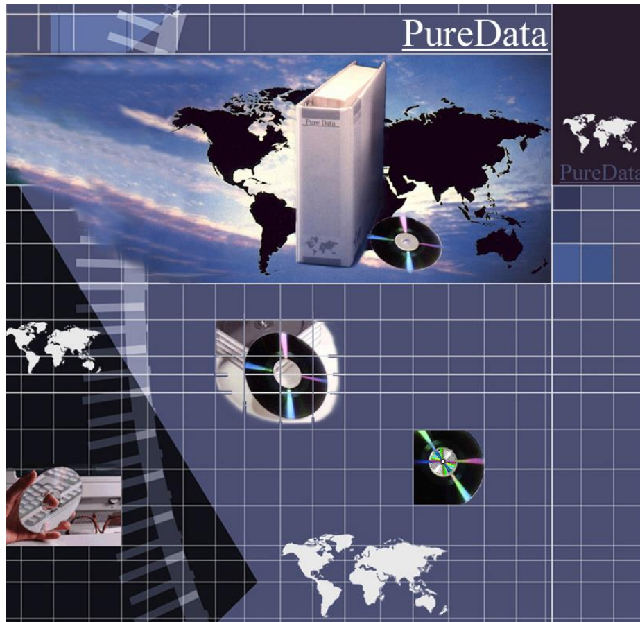
Table Salt, Pepper & Spices World Purchasing & Procurement Report & Database

Data Group Data Africa Group Data Asia Group Data Europe Group Data USA Group